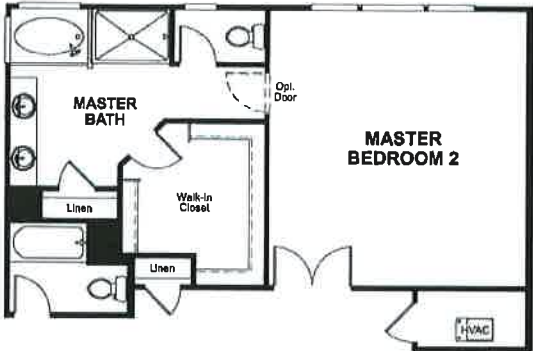
OPT. MASTER BEDROOM 2