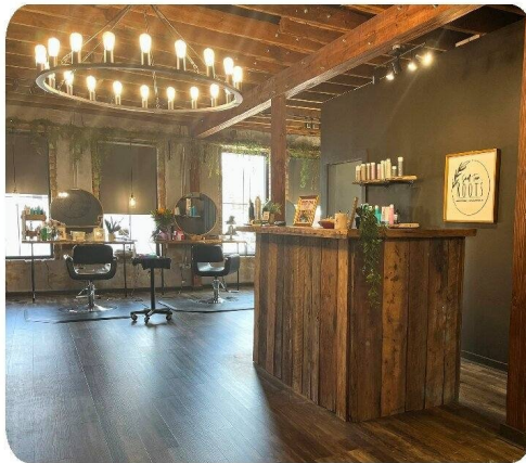
107 - A Small Town Roots