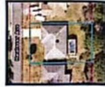
AERIAL PHOTOGRAPH (NOT TO SCALE)