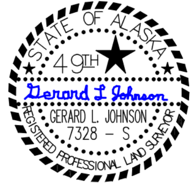
VICINITY MAP 1" = 1 mile