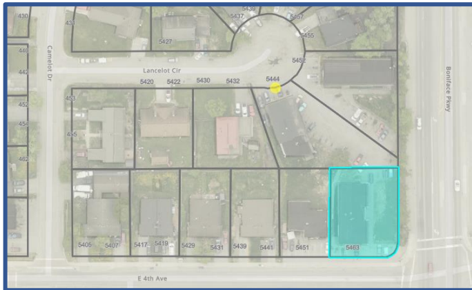
5463 E. 4th Avenue, Anchorage, AK 99508 (Above)