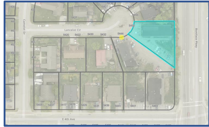
5452 Lancelot Circle, Anchorage, AK 99508 (Above)