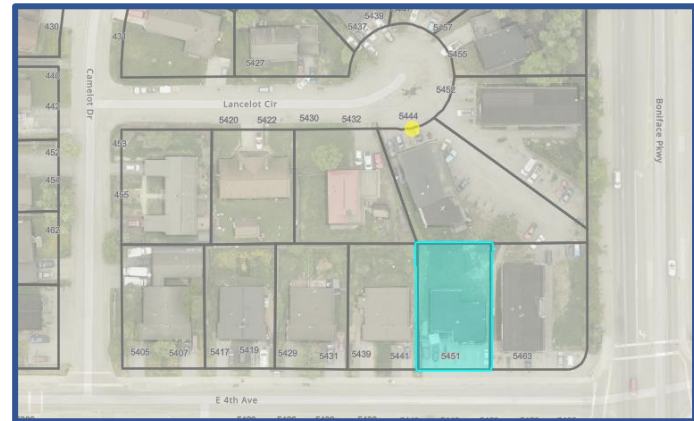
5451 E. 4th Avenue, Anchorage, AK 99508 (Above)